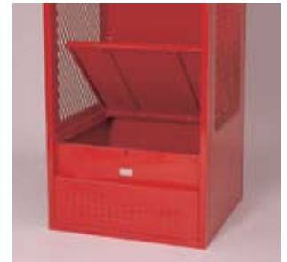
Footlocker Doubles as Seat and Storage Locker

FOOTLOCKER: Front footlocker panel includes single point latch with padlock strike plate and mini louvers. Footlocker top has a continuous hinge. Opening and closing is quieted by rubber bumpers mounted to the contact points. Seat is strengthened with two reinforcement channels welded to bottom of seat. Two side seat supports are fastened to side panels and inserted in a support tab on the front locker panel for added strength.