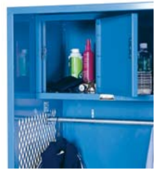
Locking Security Box

SECURITY BOX: 14 gauge lockable door with a 16 gauge side panel. The door is attached to a welded frame with a continuous hinge. The hinge is mounted to door with aluminum rivets. The door is locked with a single point latch by a padlock or built in lock. A lock hole cover plate shall be provided for use with padlocks. Security box door frame members to be not less than 16 gauge formed to a channel shape. Vertical members to have an additional flange to provide a continuous door strike. Intermembering parts to be mortised and tenoned and electrically welded together in a rigid assembly capable of resisting strains.