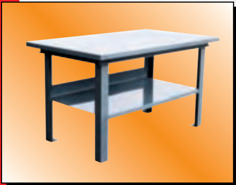
Model WF Shown