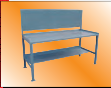
Model WR Shown