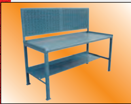
Model WT Shown