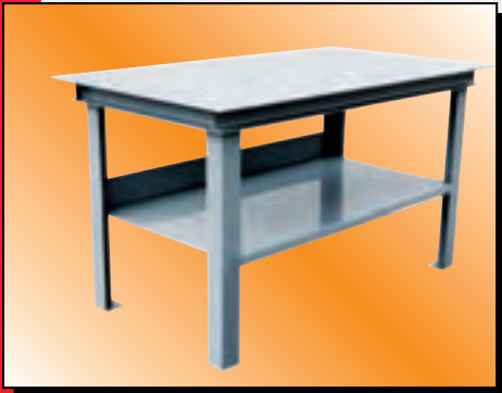
Model WD Shown