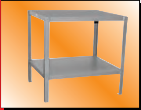
Model WS Shown