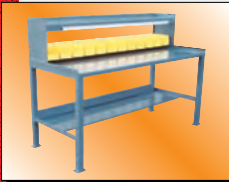
Model WC Shown