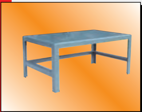
Model DR Shown