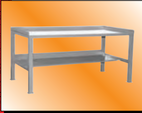
Model WB Shown