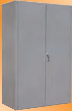
Model DL Shown