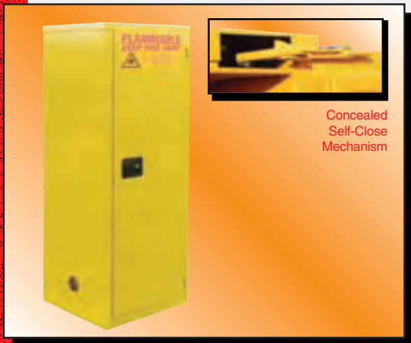
Concealed Self-Close Mechanism

Models BJ - 1 door self close, double wall cabinet to contain flammable liquids in protected storage in single & double depth