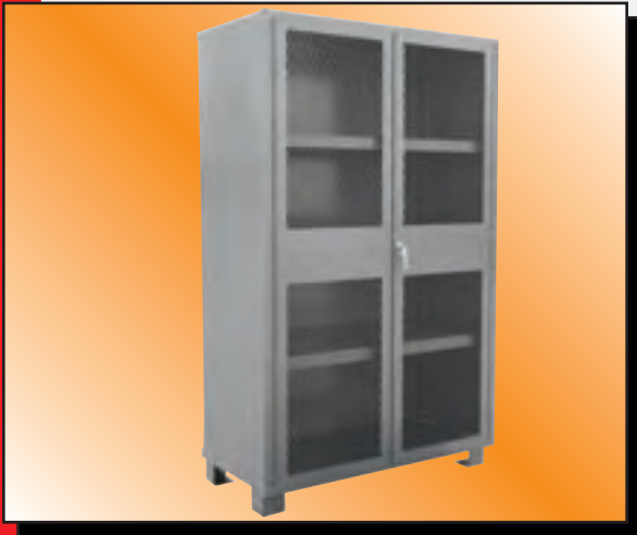
Model DM Shown

Models DM - Durable closed storage, with clearview of contents, to secure materials and valuables 1,800 LB CAPACITY PER SHELF