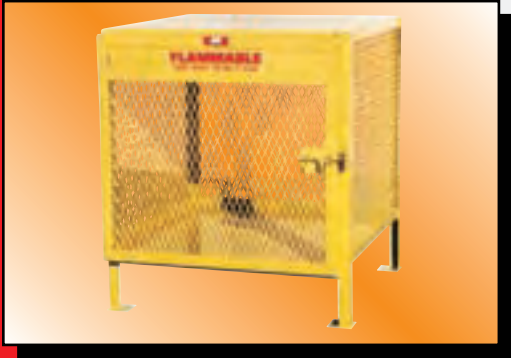
Model CW Shown