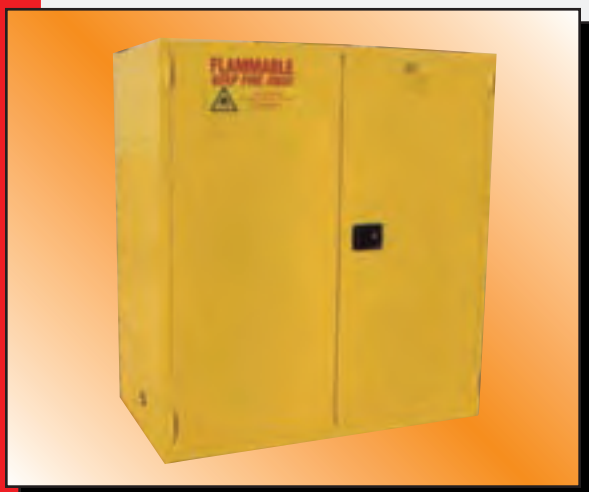
Model BV Shown