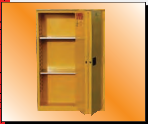
Model BF45 Shown