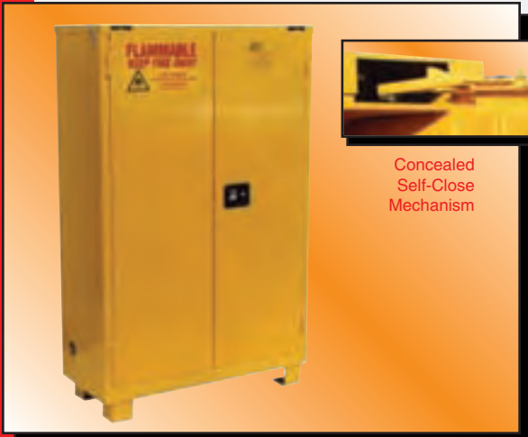
Concealed Self-Close Mechanism