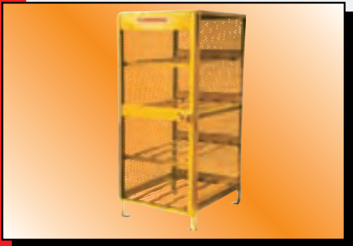
Model CH Shown