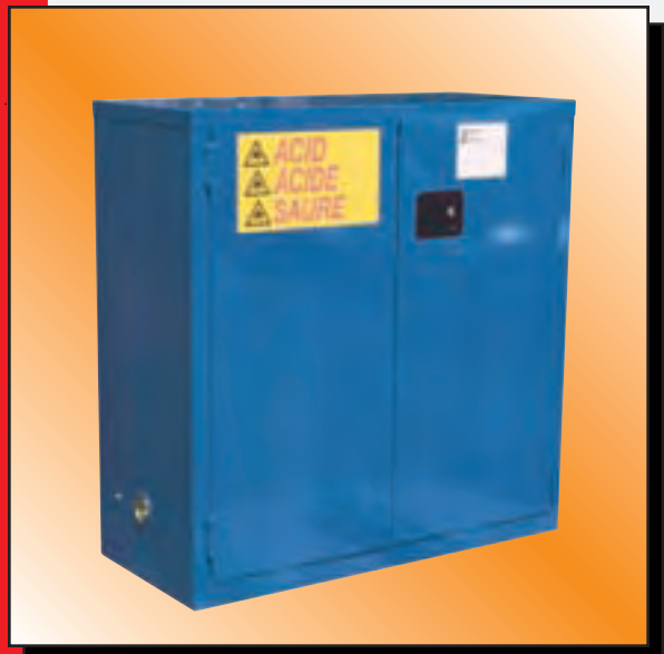
Model CL30 Shown

Models CL, CK & CJ - manual, bi fold & self close doors with double wall cabinets to contain chemicals in protected storage