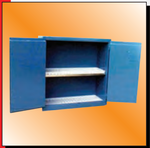
Model CL30 Shown