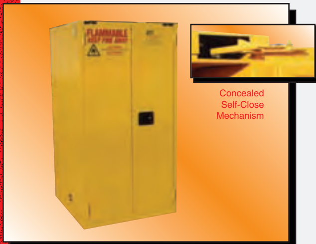
Concealed Self-Close Mechanism