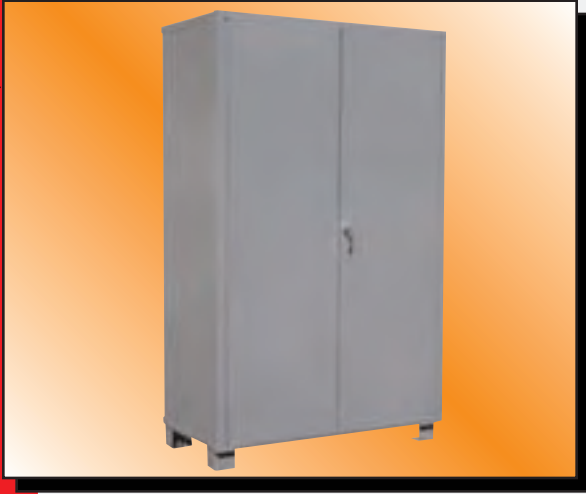
Model DS Shown

Models DS - Durable closed storage cabinet to secure materials and valuables 1,800 LB CAPACITY PER SHELF