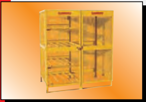
Model CX Shown