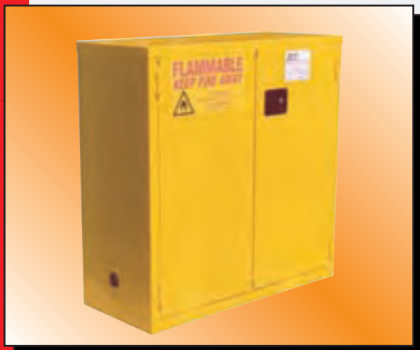
Model BT22 Shown