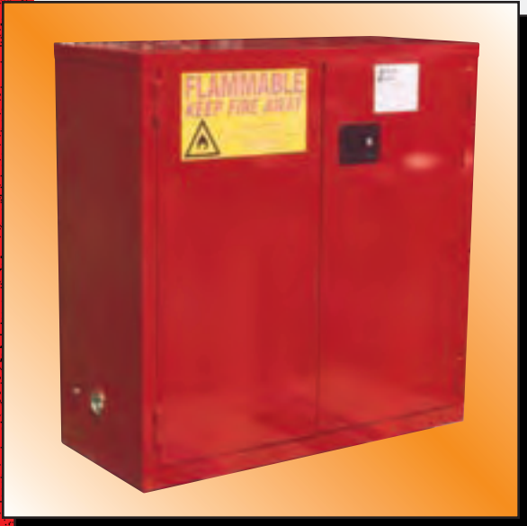
Model BP48 Shown

Models BP, BN & BH - manual, self close & bi fold doors with double wall cabinets to contain paint & ink cans in protected storage