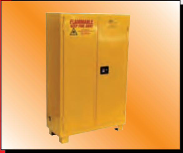
Model FM45 Shown

Models FM, FS & FF - manual, bi fold & self close doors with double wall cabinets to contain flammable liquids in protected storage with floor clearance