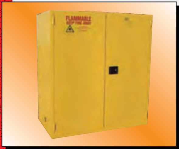
Model BM90 Shown

Models BM, BS & BF - manual, bi fold & self close doors with double wall cabinets to contain flammable liquids in protected storage