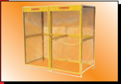
Model CV Shown