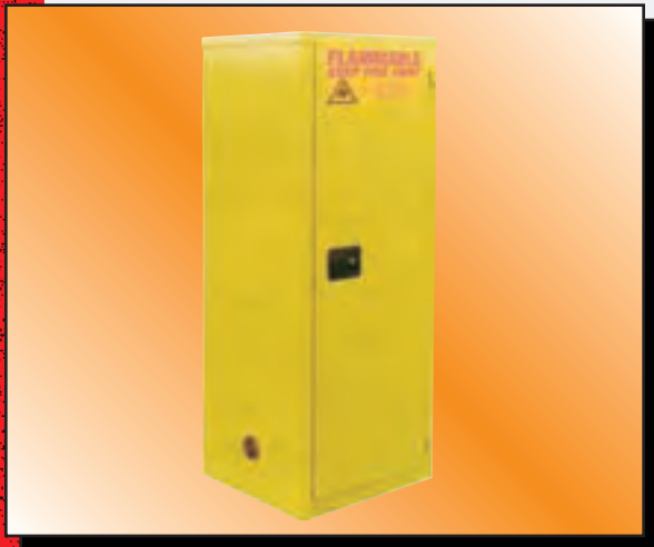
Model BA Shown

Models BA - 1 door manual, double wall cabinet to contain flammable liquids in protected storage in single & double depth