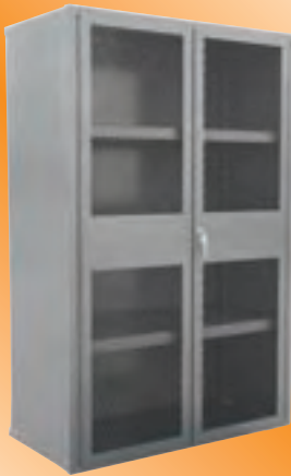
Model DJ Shown