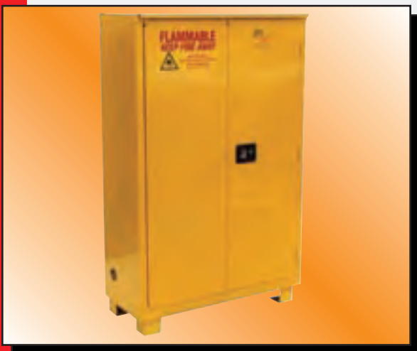
Model FF45 Shown